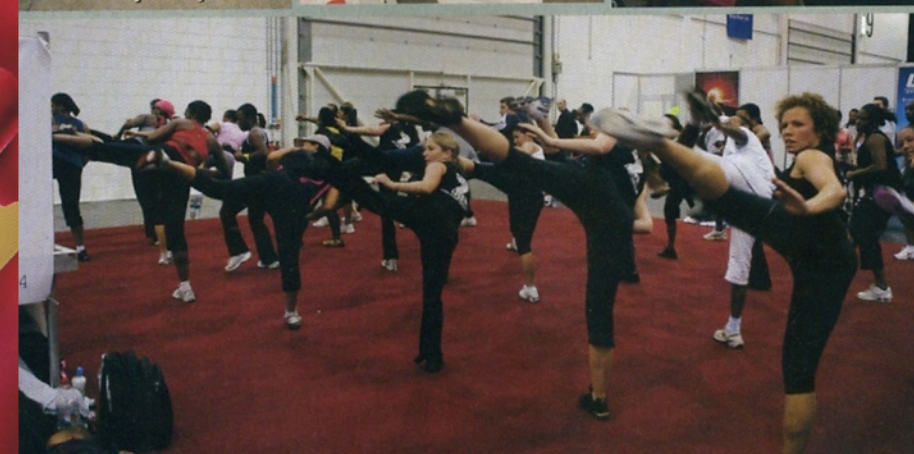
Top fitness and martial arts professionals showed how to kick start your new fitness regime