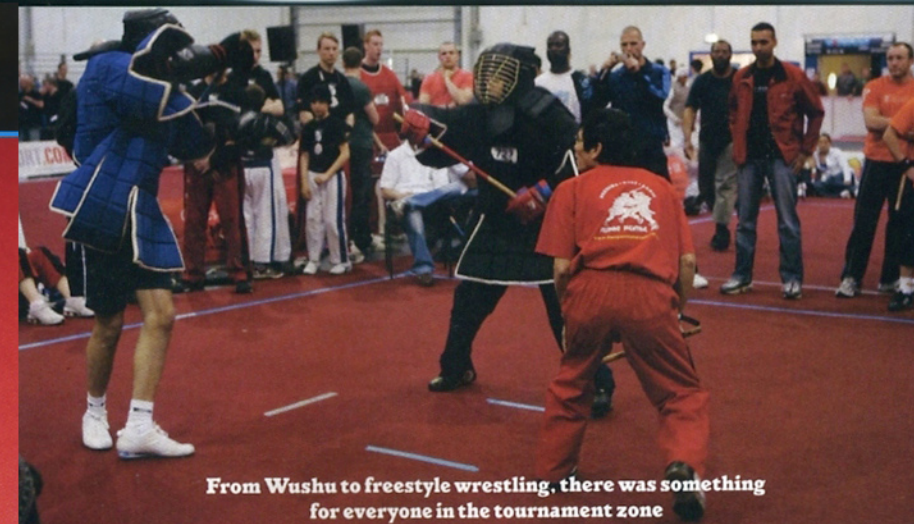
From Wushu to freestyle wrestling, there was something for everyone in the tournament zone